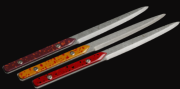
Anmon Paper Knife

Continuing the tradition from the days of Samurai. Make your life rich.